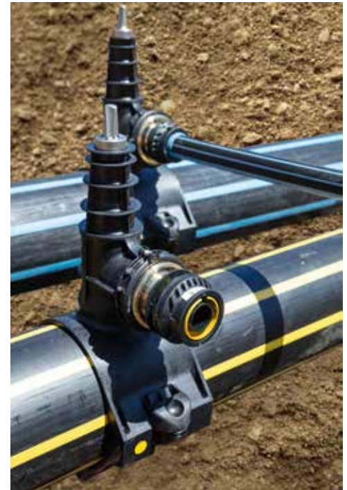
Underground supply lines for drinking water, gas and hydrogen: reliable and economic.

The systems therefore offer various special solutions in addition to the large number of fitting types. Special adapters ensure trouble-free connection to other piping systems by providing internal or external threads or screw fittings, for example. The repair coupling allows quick and simple repair of damaged pipes. For this purpose, a short piece is cut out of the pipe and the coupling is slid onto one end and then pulled back. The gap is closed, the press connector is pressed, and the operational safety is restored.