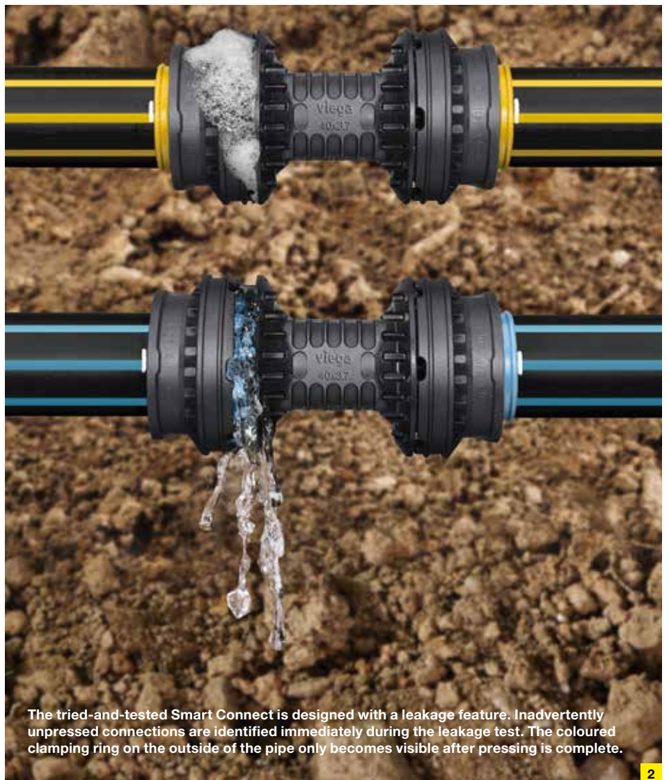
The tried-and-tested Smart Connect is designed with a leakage feature. Inadvertently unpressed connections are identified immediately during the leakage test. The coloured clamping ring on the outside of the pipe only becomes visible after pressing is complete.

The clamping ring of the Geopress K and Geopress K gas connectors fulfills two functions: On the one hand, it ensures a connection that is high-tensile and, on the other hand, it serves as an unmistakable marker that the connection is correctly pressed. This is because the clamping ring only becomes visible on the outside of the pipe after the pipe has been pressed, thus indicating a complete and safe pressing (Fig. 2).