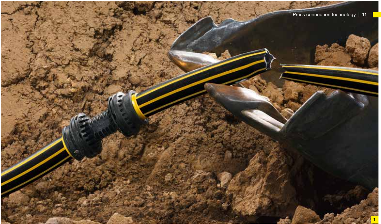
The connectors of Geopress K and Geopress K gas (shown) pass the "digger test" in real-life circumstances as well.